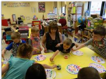
~ Half or Full Day Pre-K ~