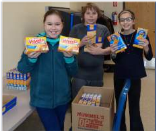
~ Community Service ~