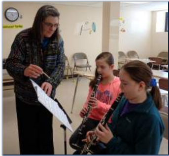
~ Music ~