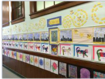
~ Art ~